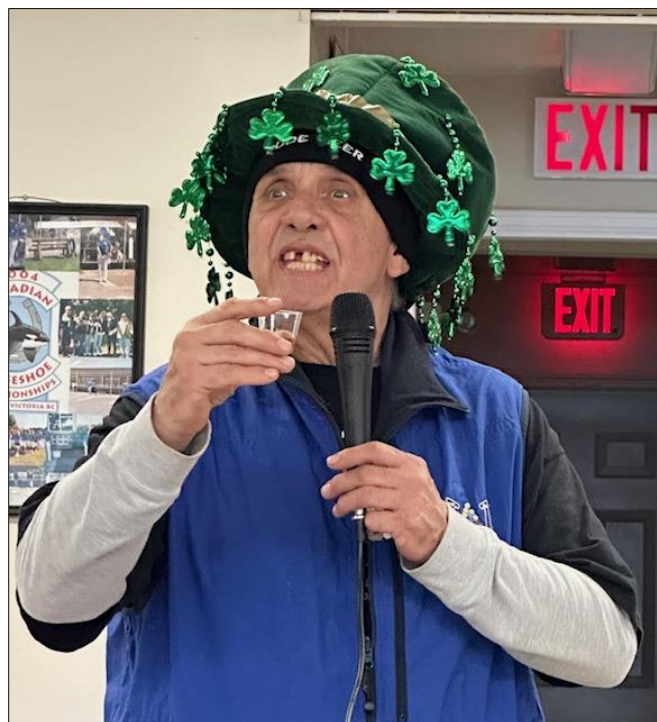
A little added drama is always appropriate when delivering the limerick punchline!