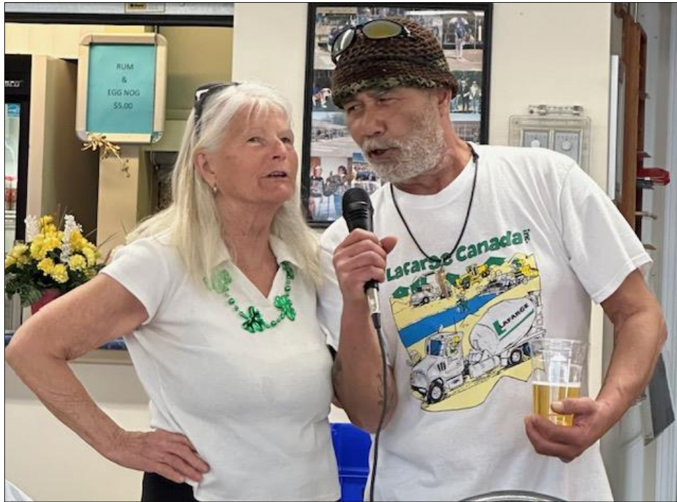
Harmonizing young lovers singing an old standby always sets a festive mood!