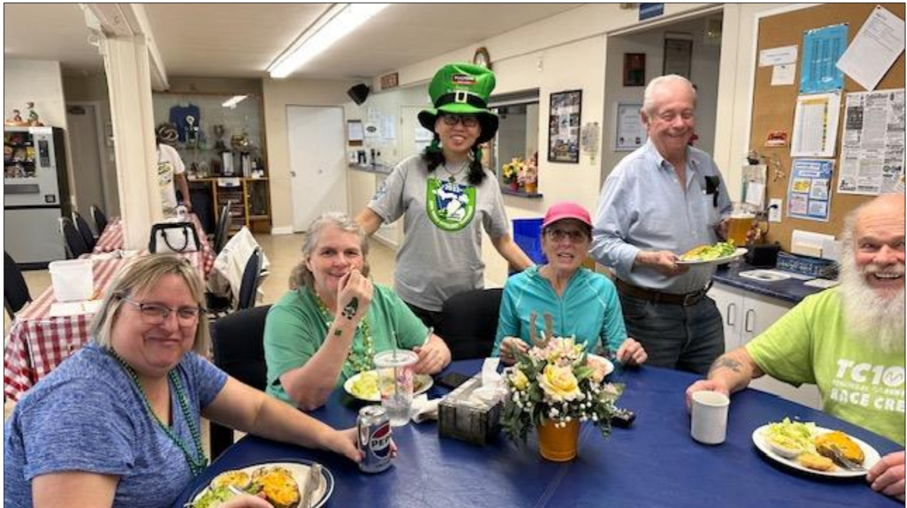
Some of our members enjoying their lunch