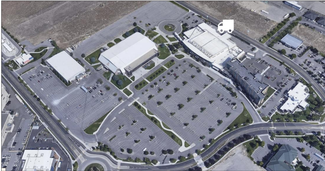
Overall view of parking for this year's World Championships

Are you ready to go? There's still time to register. Here's the link to the registration form. You can print it and mail it or you can do it all online with a credit card. Be sure to read ALL the information first!