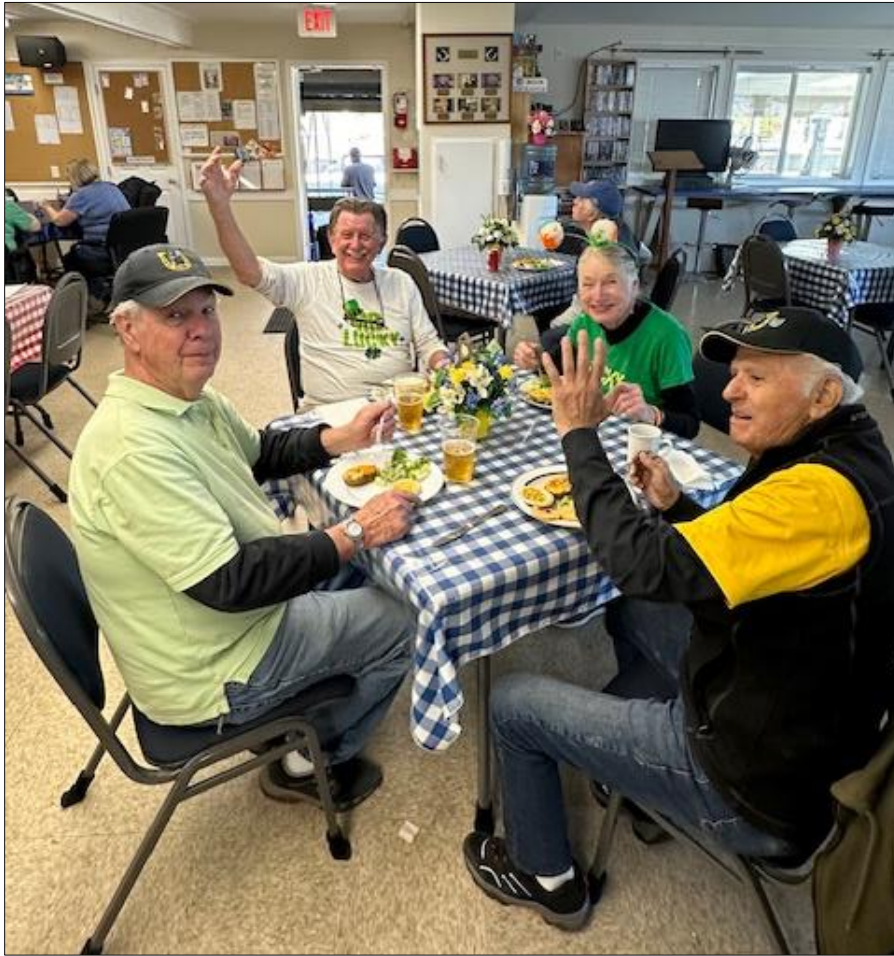
Sooke was well-represented at lunch and for the original (naughty) limericks.